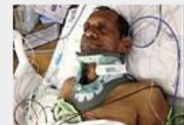
Indian man sues Alabama police after...