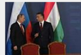
Hungary Putin deal raises EU questions

About the Janesville Generations Fund: The Janesville Generations Fund, a component of the Community Foundation of Southern Wisconsin, is a permanently endowed fund which serves as a flexible source of support for charitable projects in Janesville. The goal of the fund is to ensure funding for current community initiatives as well as to inspire donors to